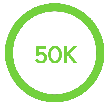
Vaccinations delivered in 4 months