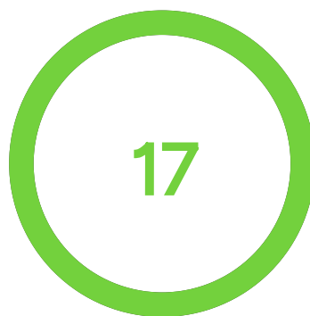
Departments using SISc